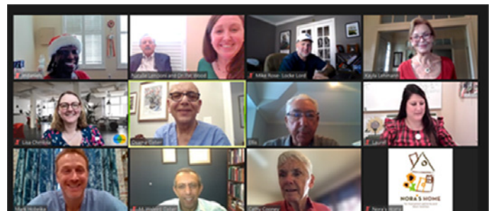
NORA'S HOME BOARD OF DIRECTORS AT DECEMBER MEETING