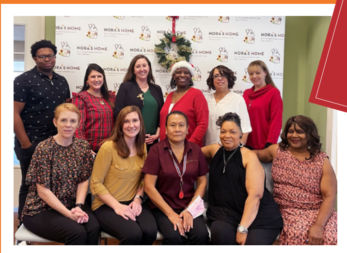
NORA'S HOME TEAM

Nora's Home provides affordable lodging for organ transplant patients and their families in the comfort of a warm, home-like environment.