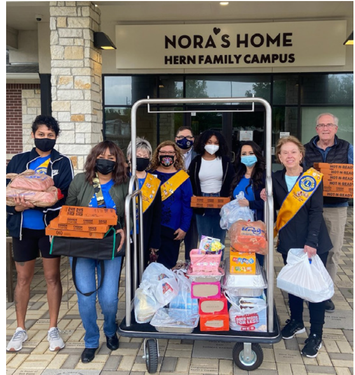
LADY LIONS DROPPING OFF DINNER