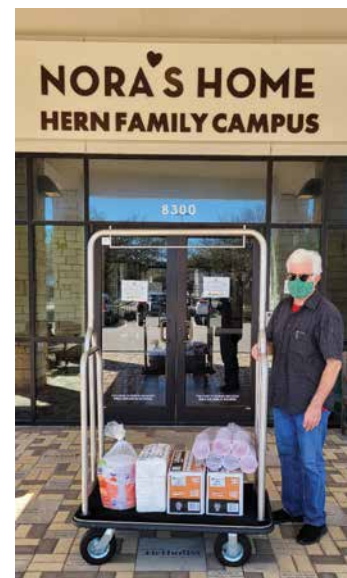
VOLUNTEER DONATING TO THE COMMUNITY PANTRY