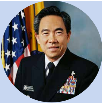
Rear Admiral Kenneth P. Moritsugu, MD, MPH, FACPM Former United States Surgeon General