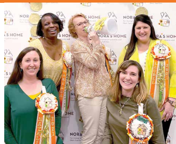
THE NORA'S HOME TEAM SHOWING OFF THEIR HOMECOMING MUMS

|| Along with spring flowers this April, we recognize Donate Life Month and join in promoting organ donation awareness... ||